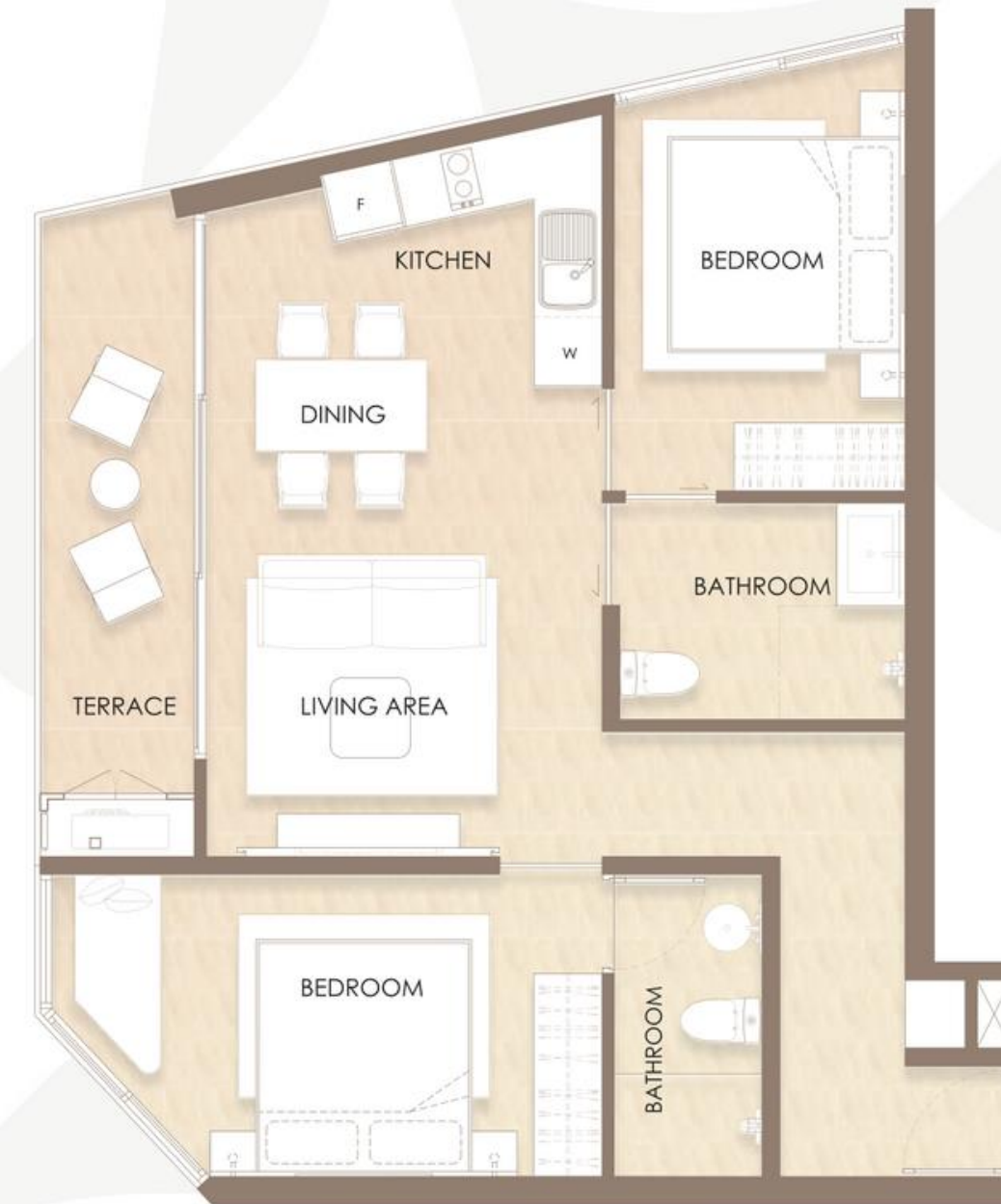
2 - BEDROOM TYPE 61.00 - 90.75 SQ.M.