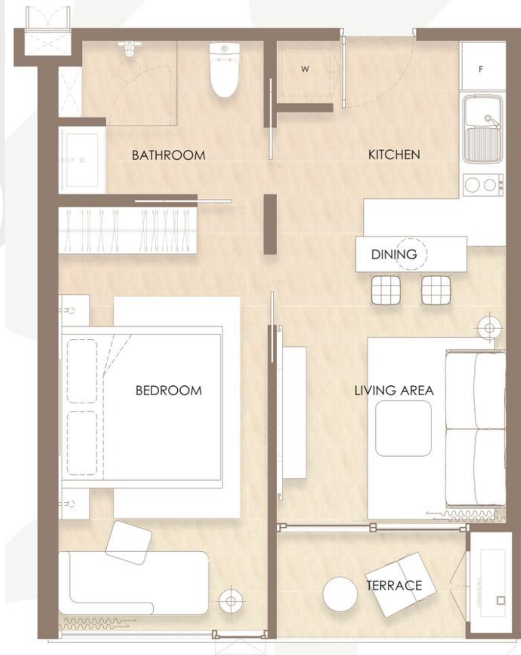
1 - BEDROOM TYPE 44.75 - 57.00 SQ.M.