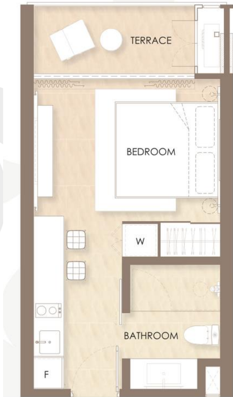
STUDIO TYPE 30.00 SQ.M.